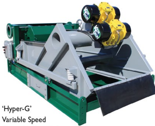
'Hyper-G' Variable Speed Linear Motion Shaker

By focusing on each customer's unique problems, KEMTRON has become more than an originalequipment manufacturer, we have become asophisticated and trusted solutions provider. As a result of this focus, KEMTRON products can now be found in over 30 countries.